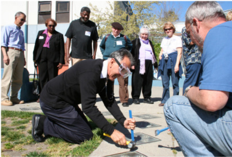
Oakland High Class of January 1959 recently opened their time capsule for their 50th Reunion this spring.